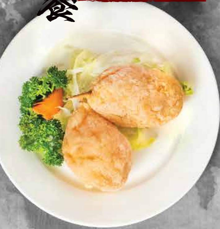
百花釀蟹鉗 Stuffed Crab Claw