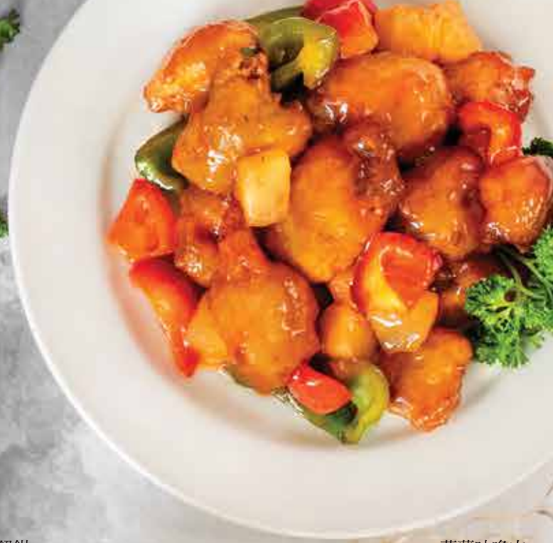
菠蘿咕嚕肉 Sweet & Sour Pork