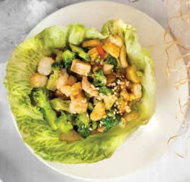
海鮮生菜包 Seafood San Choy Bao